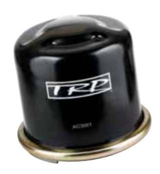
Part# AC3001 Air Dryer Cartridge replacement for Bendix® AD-IP®