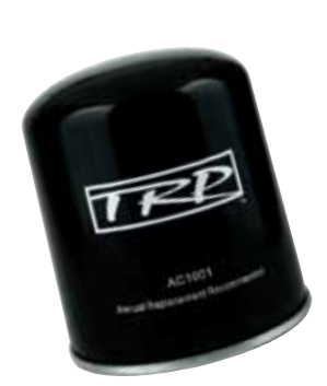
Part# AC1001 Air Dryer Cartridge replacement for Bendix® AD-SP®/AD-IS®