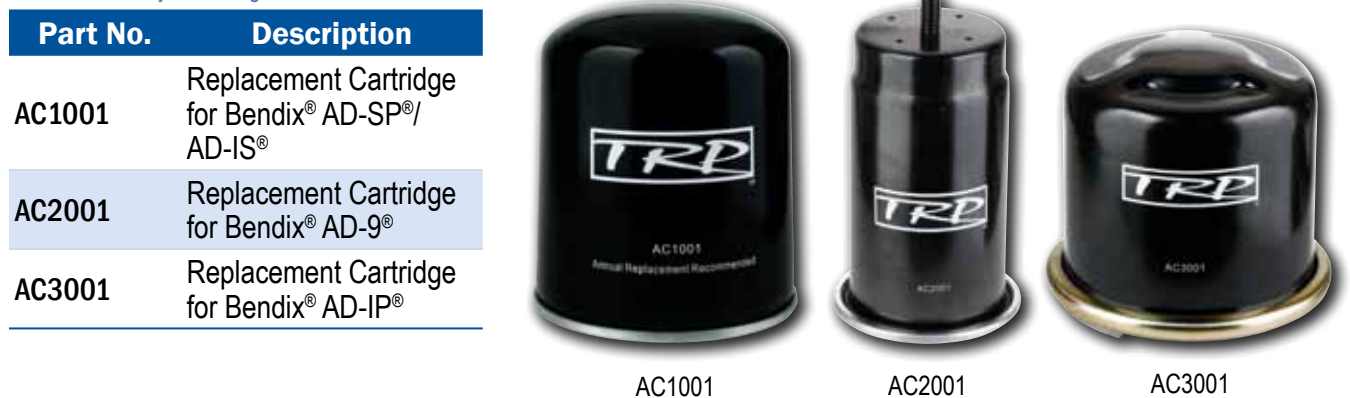
Table 2-1: Air Dryer Cartridges

CROSS REFERENCE FOR AIR DRYER CARTRIDGES