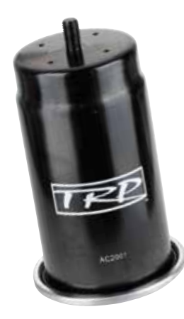
Part# AC2001 Air Dryer Cartridge replacement for Bendix® AD-9®